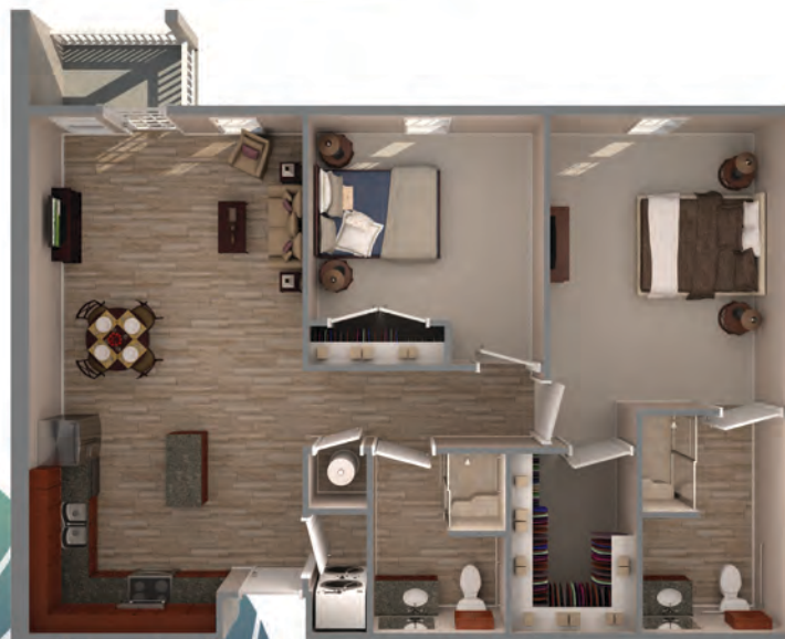
The Graceland 1057 sq. ft.