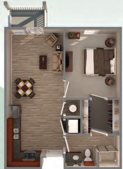
The Cumberland 590 sq. ft.