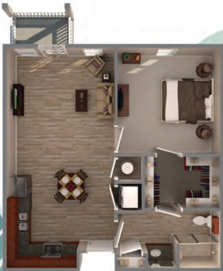
The Ridge 697 sq. ft.