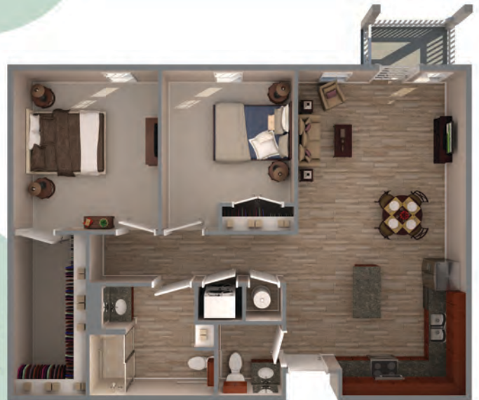
The Ryman 1005 sq. ft.