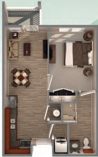
The Bristol 517 sq. ft.