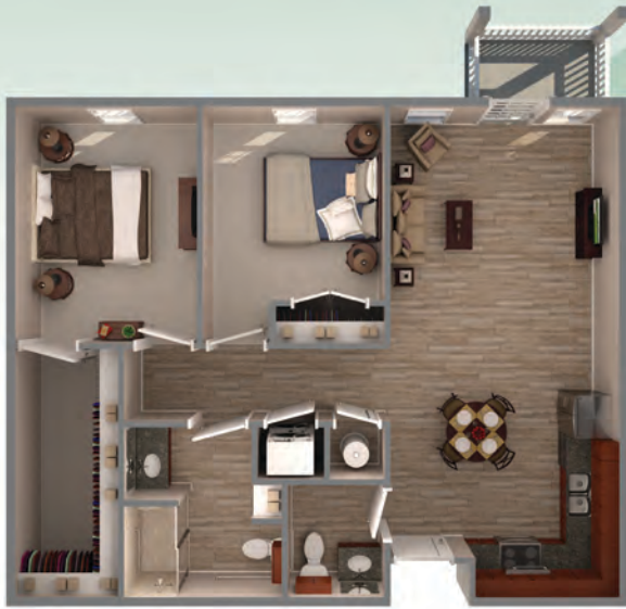
The Pike 888 sq. ft.