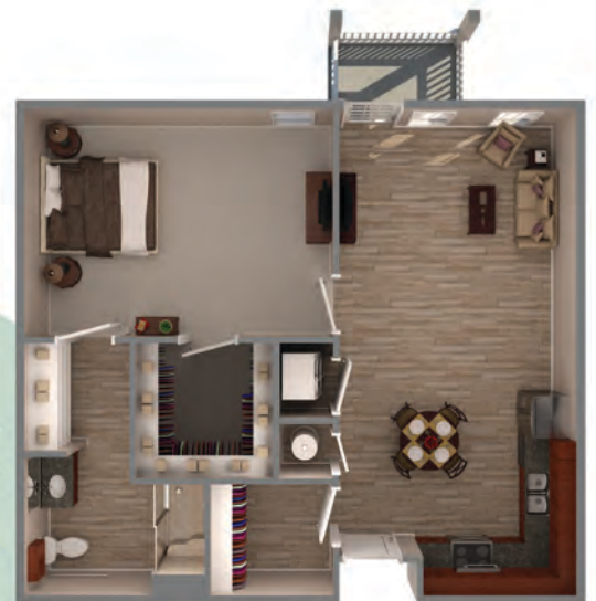
The Timberlake 819 sq. ft.