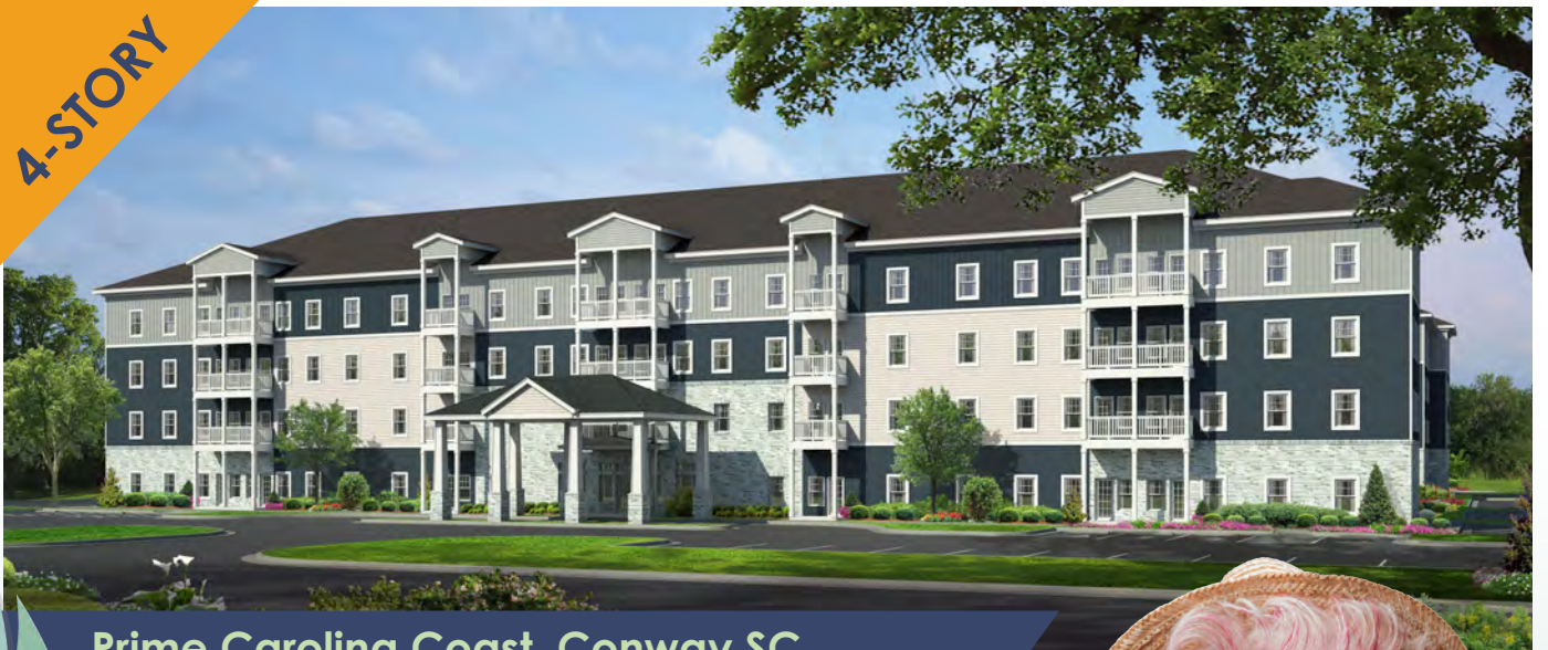
Prime Carolina Coast, Conway SC