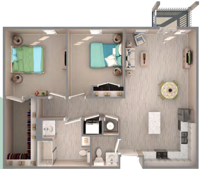
Shine 1005 sq. ft