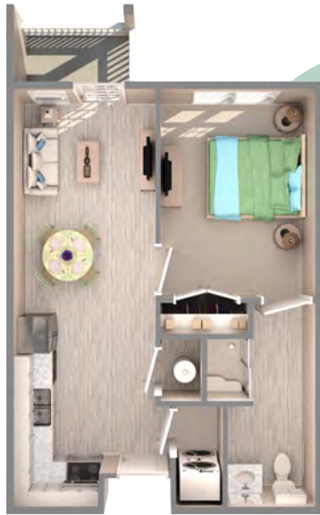
Rise 517 sq. ft