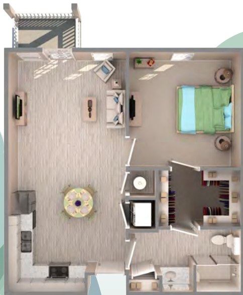
Flourish 697 sq. ft