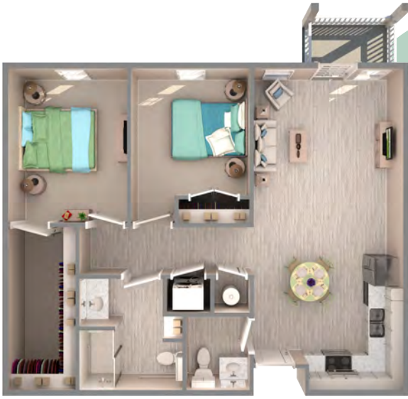
Soar 888 sq. ft