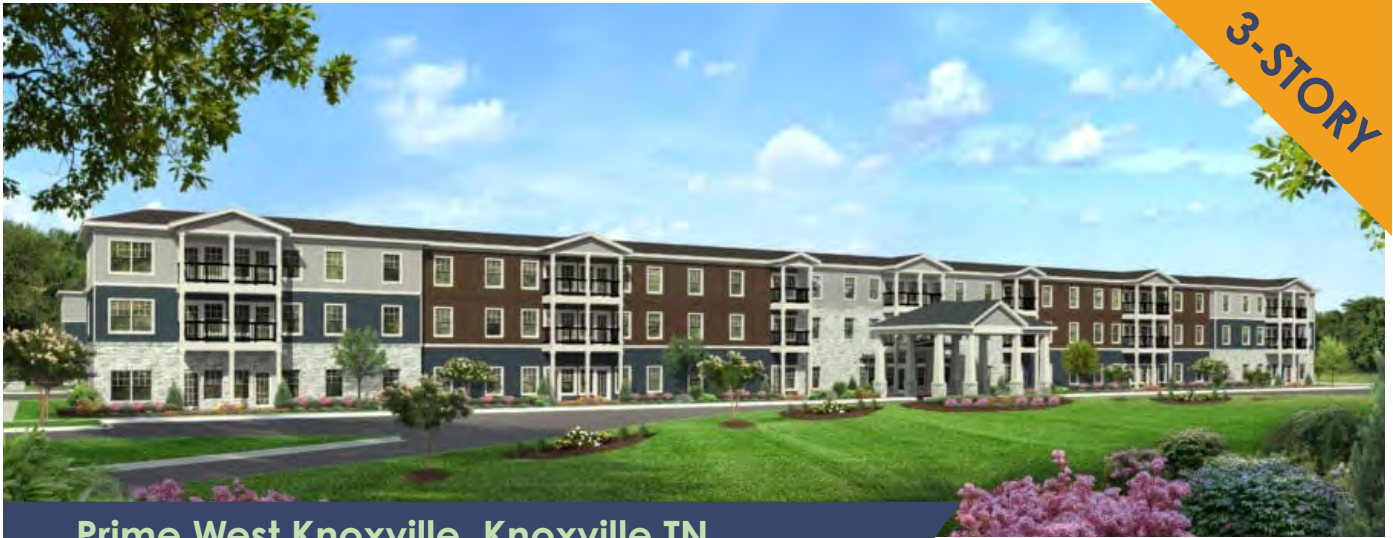
Prime West Knoxville, Knoxville TN