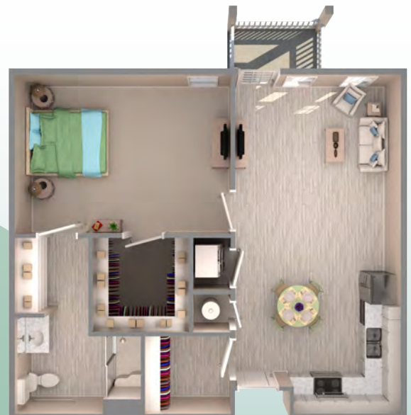
Dream 819 sq. ft