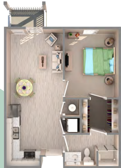
Thrive 590 sq. ft