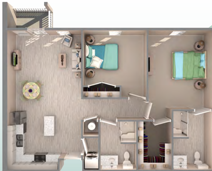
Imagine 1057 sq. ft